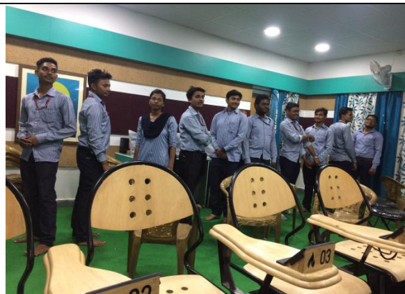
Students doing different activities during sessions