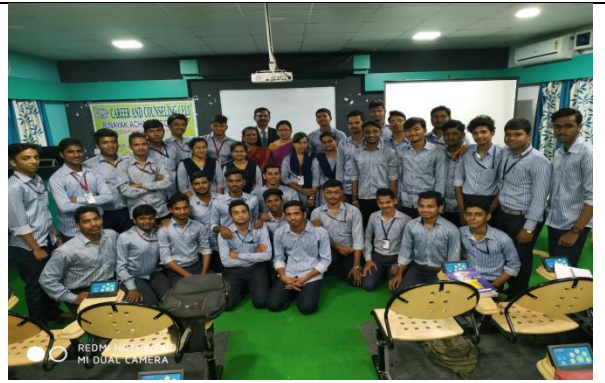
Group Photo after the session